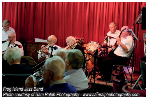
Frog Island Jazz Band

ARTWORK BY CHENEY GRAPHICS FOR THE JAZZ GUIDE