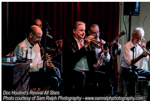
Doc Houlin'd's Revival All Stars

ARTWORK BY CHENEY GRAPHICS FOR THE JAZZ GUIDE