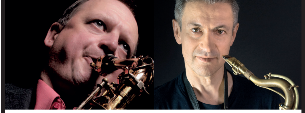
The Jaguar Club, Fenton Road, off Browns Lane Coventry CV5 9PS