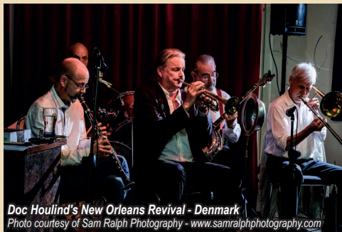
Doc Houllind's New Orleans Revival - Denmark

ARTWORK BY CHENEY GRAPHICS LTD FOR JAZZ GUIDE